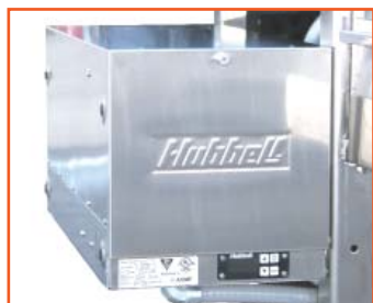
(AVAILABLE WITH) STAINLESS STEEL BUILT-ON BOOSTER.